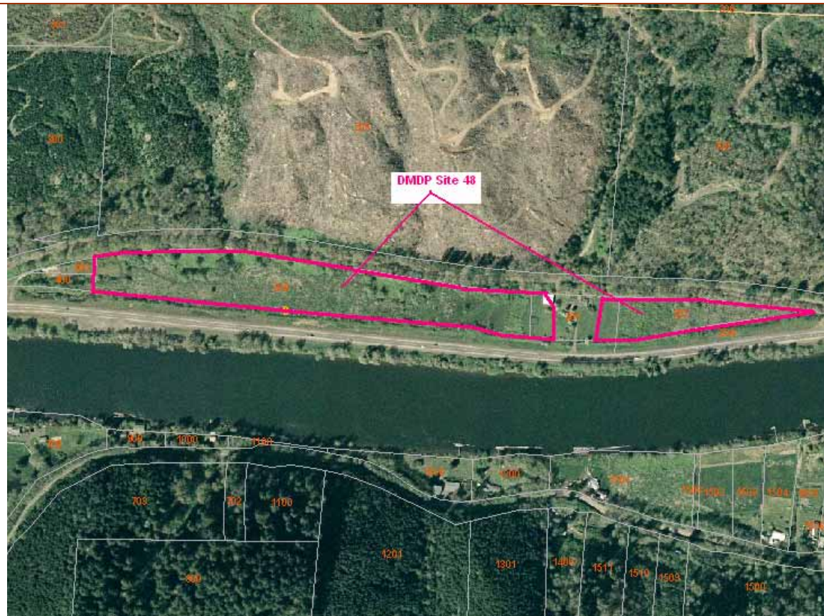
2004 aerial with site boundaries

DMDP Site 48 is not depicted on Official Coastal Zoning Map Plot # 063.